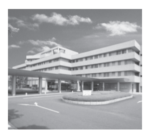
IUHW Shioya Hospital Number of Beds: 240