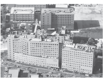
Takagi Hospital Number of Beds: 506