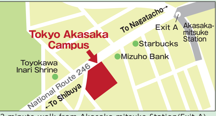
3-minute walk from Akasaka-mitsuke Station(Exit A)