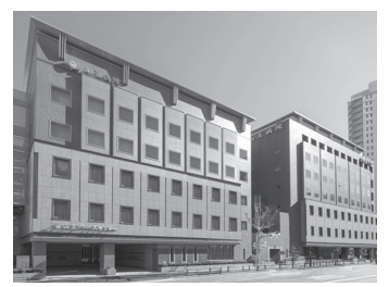
Sanno Hospital / Sanno Birth Center Number of Beds: 79/19